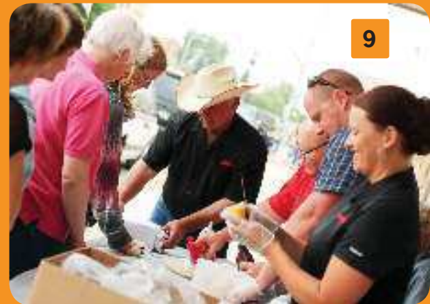
1. Donation to Hope Village 2. BEK Life Country Cook-off 3. Celebrating Coop Month delivering treats to Gratech 4. National Night Out 5. MSU Tech Day 6. Coop Day at the North Dakota State Fair 7. Ice Cream Social under Coop Tent at NDSF 8. Tough Enough to Wear Pink Remote at SRT Connections Store 9. SRT out serving banana splits at Towner Days