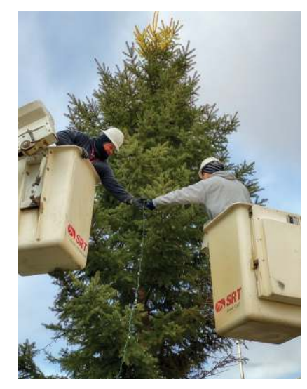
SRT Lights Up Minot's

Downtown Tree / As a community partner and proud supporter of Downtown Minot, SRT employees strung the lights on the Christmas tree in preparation for the Downtown Christmas Open House that occurs every year the day after Thanksgiving. It was a great way to give back to our community and begin the holiday season!