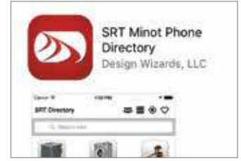
Promote your Business in the Directory!