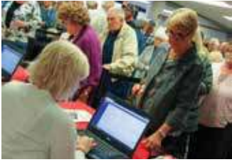
SRT's Annual Meeting Postponed