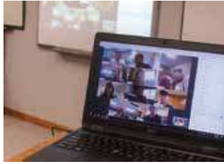
Business (Almost) As Usual