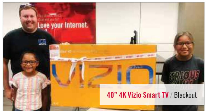
40" 4K Vizio Smart TV / Blackout

winners, which was a 40" 4K Vizio Smart TV. Customers were able to check for daily numbers not only on the SRT Facebook page, but also srt.com/bingo and the electronic sign outside the SRT headquarters office. SRT's Facebook page saw a great increase in engagement, giving us a way to connect to our customers even with the lack of events this year. Our participating customers seemed to have a great time playing bingo!