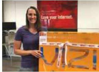
CUSTOMERS WIN BIG WITH SRT BINGO