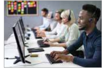
STOP TELEMARKETING CALLS