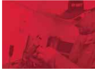
OCTOBER IS COOPERATIVE MONTH!