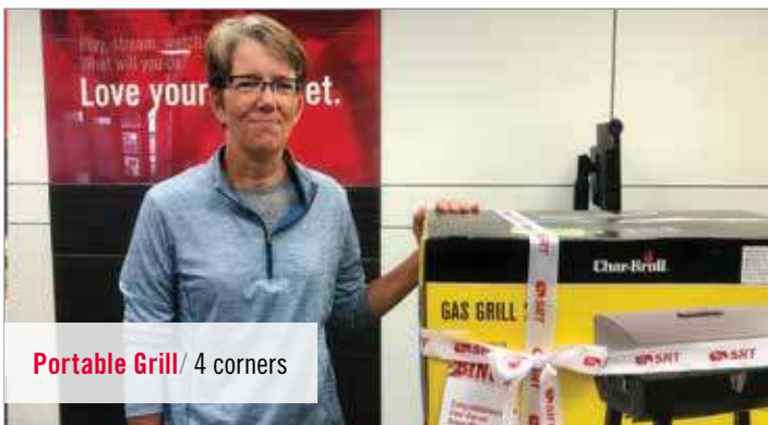
Portable Grill / 4 corners