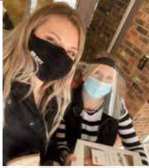
Good Samaritan Society - Mohall