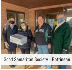
Good Samaritan Society - Bottineau