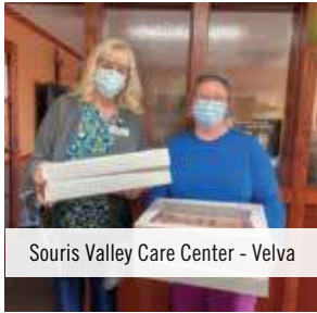
Souris Valley Care Center - Velva