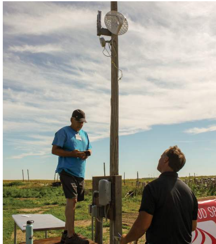
A WiFi-enabled system allows the Lord’s Cupboard to monitor and water its food pantry garden remotely, saving travel expenses and volunteer time.