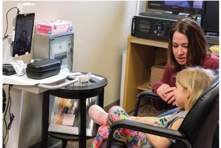
A school nurse conducts a telehealth appointment with a student over a high-speed Internet connection.

Community provider as part of a national network of similarly innovative communities.