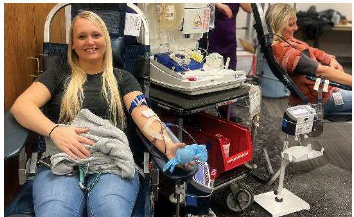
BLOOD DRIVE – Employees volunteered to give blood at SRT's biannual blood drive.

Airmen Leadership School is a five-week course designed to develop airmen into effective front-line supervisors.