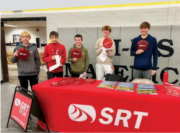
NORTH CENTRAL SEED SHOW & AG EXPO – Students visited the SRT booth at the annual Ag Expo in Mohall.