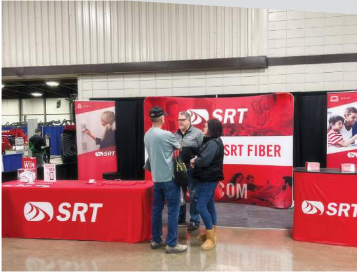
KMOT AG SHOW – In January, SRT sponsored the Living Ag Classroom at the KMOT Ag Expo. Employees also educated visitors on our high-speed Fiber Internet and gave away a digital weather station.