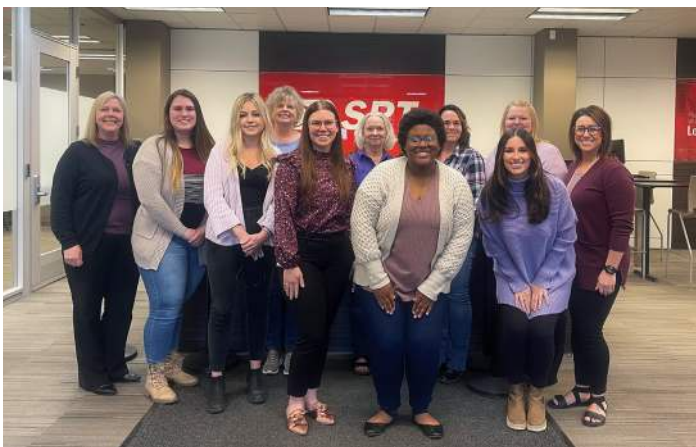
PURPLE UP DAY – Employees wore purple to show their support for military children at Minot Air Force Base and all over the world.