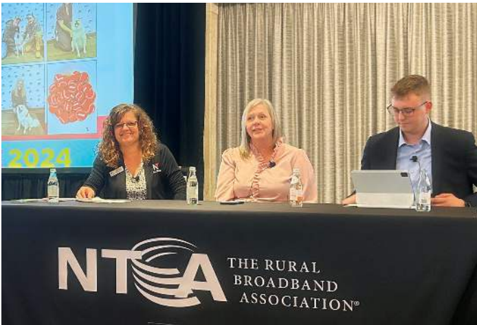
NTCA RTIME – Directors and SRT leadership attended America's largest annual rural telecommunications industry event. It focuses on policy, technology, healthcare, agriculture, community growth, and advocacy.