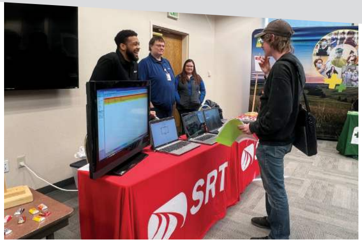
MSU CAREER EXPO – Students got to learn about career paths at SRT and see real-time alarm and internet traffic monitoring.