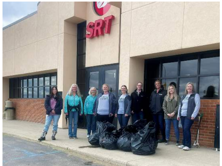
CITYWIDE CLEANUP – Organized by the Minot Area Chamber EDC, SRT employees took part in the annual citywide cleanup by picking up litter around and near SRT headquarters.