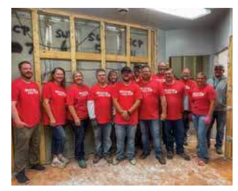
SVUW DAY OF CARING — Employees rolled up their sleeves to demolish the old Knowles Jewelry building. The work contributed to an area-wide Day of Caring through the Souris Valley United Way.