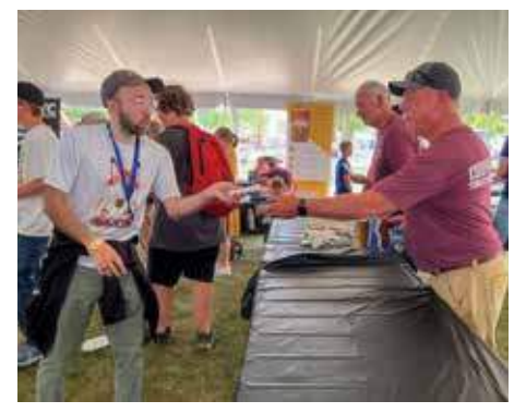
KX CO-OP DAY — SRT Board members volunteered to serve a pancake breakfast in the morning and ice cream sandwiches in the afternoon at the North Dakota State Fair.