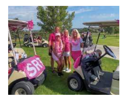
TRINITY WOMEN'S BUILDING HOPE GOLF TOURNAMENT — SRT employees swung for hope at the annual Trinity Health Foundation fundraiser.