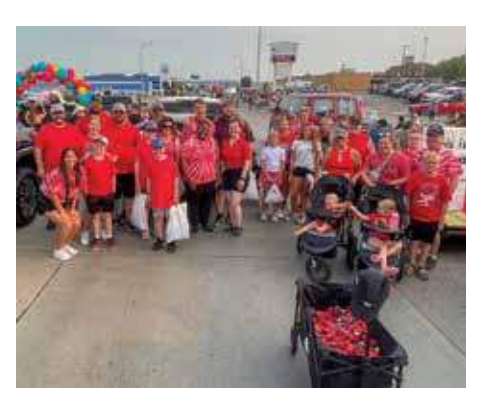
ND STATE PARADE – SRT was one of more than 180 floats in the ND State Parade. Nearly 30 people walked on behalf of SRT.