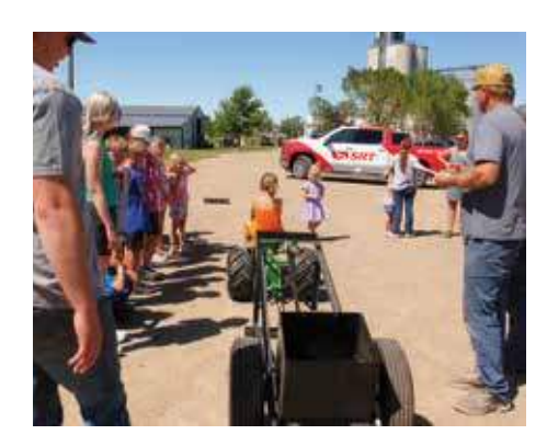
RENVILLE COUNTY FAIR – SRT proudly sponsored the annual kids' Coin Hunt and Tractor Pull at the Renville County Fair.