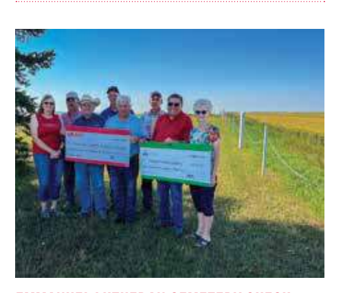
EMMANUEL LUTHERAN CEMETERY CHECK PRESENTATION — SRT Board members and cemetery volunteers held a check presentation for a grant match from SRT and the Rural Development Finance Corporation. Cemetery volunteers used the funding to replace old fencing.