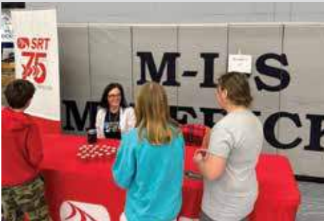
NORTH CENTRAL SEED SHOW AND AG EXPO – SRT celebrated Ag and Telecommunications with attendees of all ages at the 81st annual expo in Mohall.