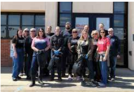
MINOT AREA CHAMBER EDC CITYWIDE CLEANUP – Each year, SRT takes pride in joining other teams around Minot who head outside to spruce up our city.