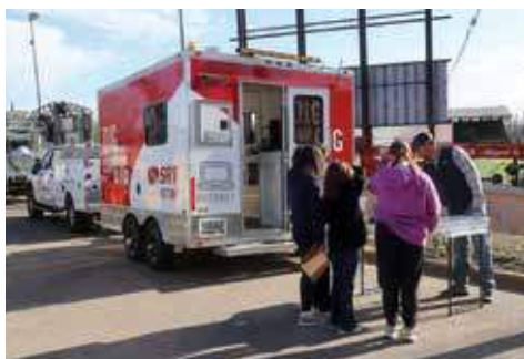
ELEMENTARY SCHOOL VEHICLE FAIRS – SRT technicians taught students about fiber internet at the Sunnyside Elementary School and Dakota Elementary vehicle fairs.