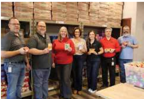
SOURIS VALLEY UNITED WAY BACK PACK BUDDIES – SRT joined SVUW to pack weekend food bags for 556 local students earlier this year.