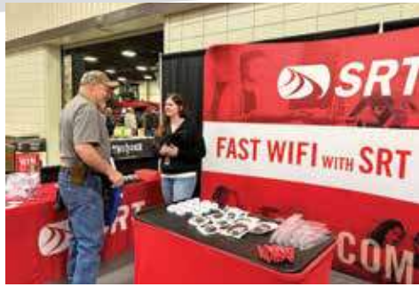
KMOT AG EXPO AND LIVING AG CLASSROOM – SRT assisted farmers and ranchers with services that can safeguard their livelihoods. We also sponsored the Living Ag Classroom, where students learn about food production and distribution.