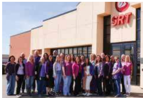
MONTH OF THE MILITARY CHILD – SRT honored military children this April on Purple Up Day and during the Famaganza event on Minot Air Force Base.