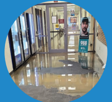
LOBBY & HALLWAY